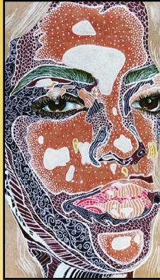
Giselle Cruz, drawing and illustration, "The Color of Me," Cinco Ranch High School, Katy ISD