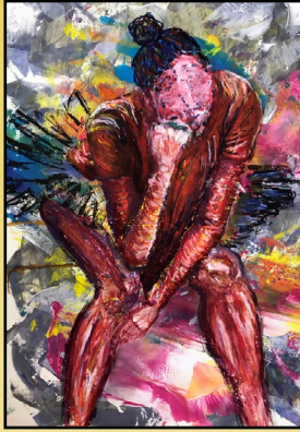
Lillian Hogan, mixed media, "Mixed Up in a Crazy World," Kingwood Park High, Humble ISD,