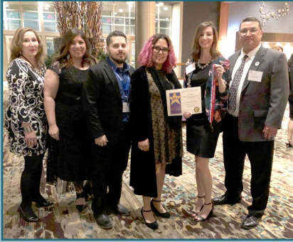
Members of the Harris County Department of Education communicators team attend the Texas School Public Relations Association Conference 2018 where the team earned 13 awards for work which benefits Harris County students and educators.

Harris County Department of Education communicators earned 12 awards for outstanding education communications from the Texas School Public Relations Association. Communications and Creative Services and Client Development